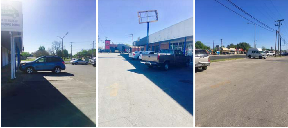
Information Herein Deemed Reliable but Not Guaranteed MLS #: C104839A